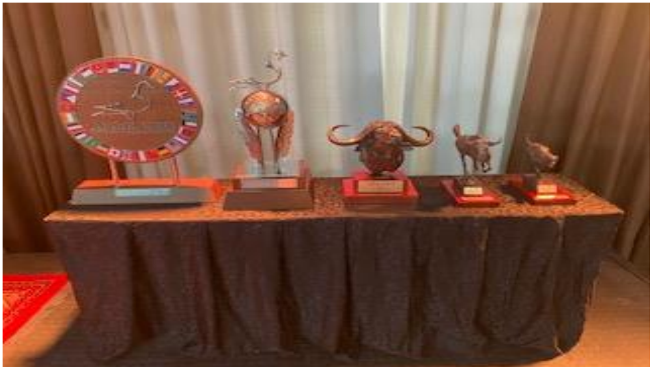
A few of the special trophies that were won in the 1st AFRIKAPRO FINAL.

A few other photographs for everybody to see.