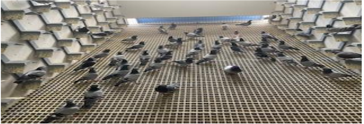
Some of the winning pigeons after they had homed from the Final Race.