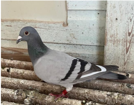
Kevin Foster's hen