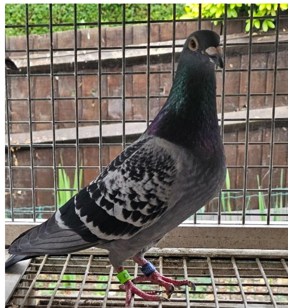
Mircea's 1 st bird

6 th Open, 2 nd South East Section, G M Preece & Son of Dover. The partnership also took 7 th , 8 th , 9 th , 10 th , 11 th , 21 st 23 rd & 31 st Open. A Team Performance to Remember. We were absolutely delighted with the team's dominant display. When the pigeons arrived, we initially assumed there must have been a break in the weather over the Channel and expected more birds to pepper the result in the UK. However, that didn't happen—and we were pleasantly surprised to see our team maintain their positions tightly together on the result sheet. It wasn't until later that evening that the full significance of the performance truly sank in. The six pigeons that arrived on the winning day are as closely related to one another as their placings. Our premier breeding couple, Jack Jones x 168, feature prominently once again—continuing to prove their class at the highest level.