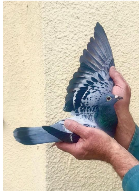
Treetops Top Notch