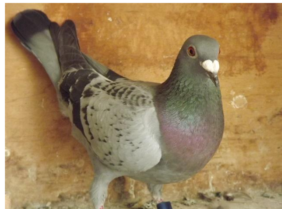
Lyden Bros hen