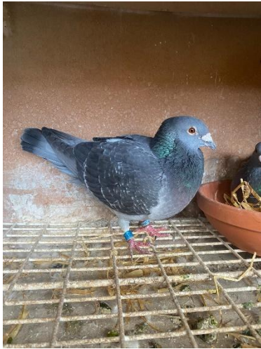
1 st bird