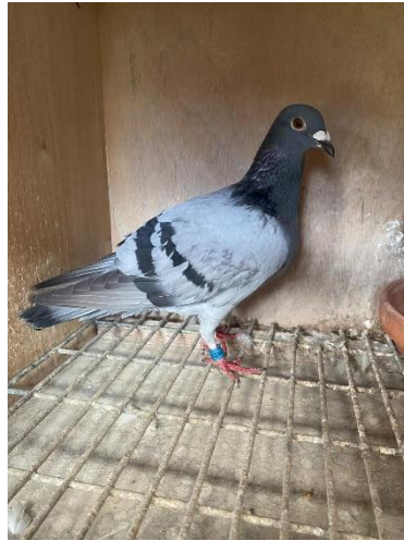
2 nd bird