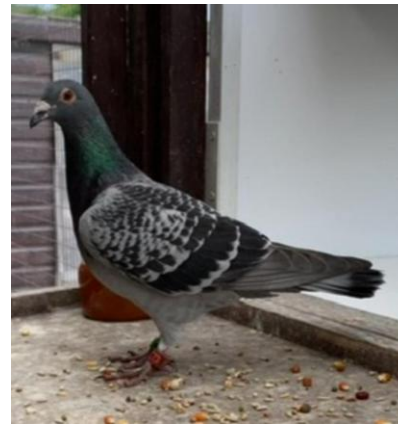
3 rd bird