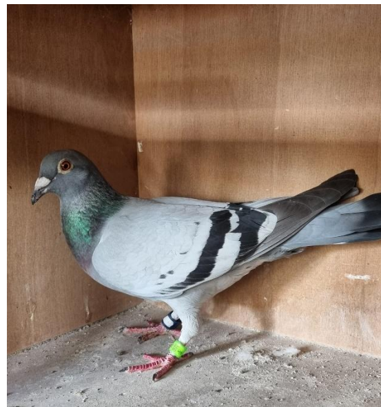
Petre Graur's hen

27 th Open, 3 rd North Centre Section, Dave Bunker Brierley of Redcar over 914 miles. My entry for the BICC Barcelona race 2025 is now called Barcelona Dream Girl, after returning home on the 5 th day of liberation into Redcar in the north east of England. She's called this because she carries strong bloodlines of Barcelona Dream the 30-year record holder for the longest flying bird from Barcelona in the BICC at 879 miles bred and raced by Jim Emerton. Barcelona Dream Girl is currently sitting at 27 th Open, 3 rd Section at 914 miles and has broken Barcelona Dream's record. She is currently the record holder, but the race is still on, and this position may change. But at least she's a record holder for now – wow what a feeling! I prepared her for the daunting task ahead of her by sending her to 5 inland races up to 200 miles and then sent her to Roye over the channel 375 miles, 3 weeks before her big race. My birds are conditioned on an open hole, with no medication except the mandatory vaccine. I give them my home made, totally natural, supplements. The feeding for this race was fats, fats and more fats, although should they choose every other grain, it is available. Quite simple really, it's more what I don't give them which is the most important. I'm very proud of her achievements and Barcelona Dream Girl is a little star.